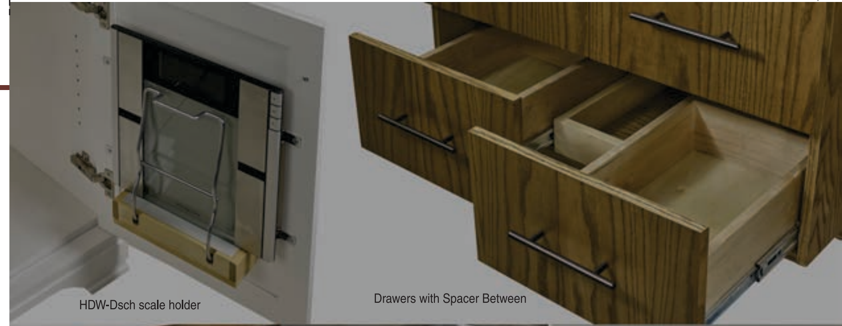
HDW-Dsch scale holder

(718) 417-1010 • NYVANITY.COM • SALES@NYVANITY.COM