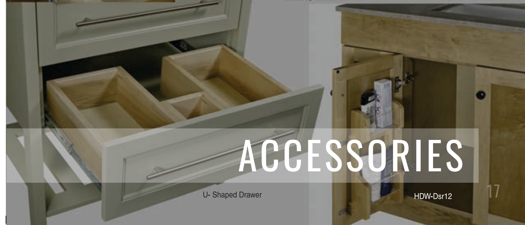
U- Shaped Drawer